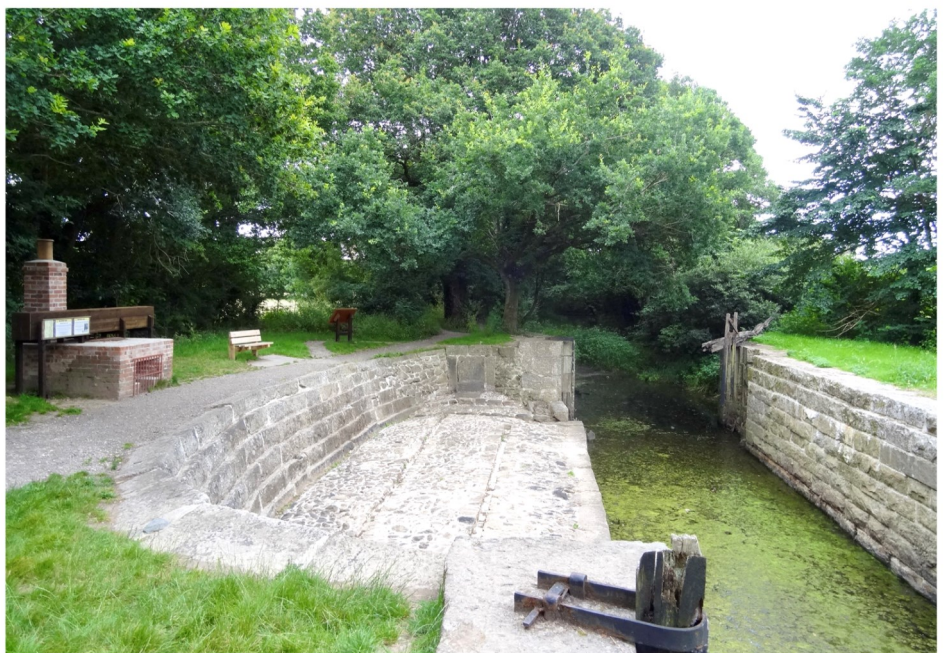
Pictured above: Graving Dock, Stover Canal