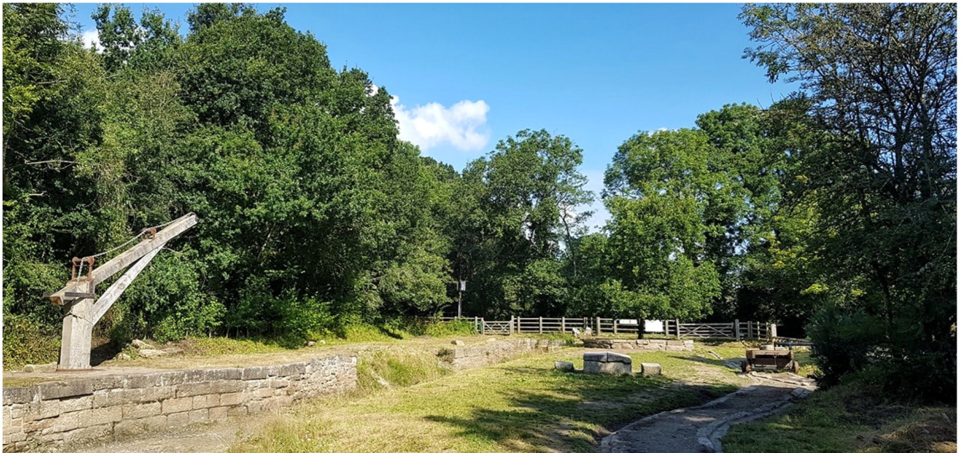
Pictured above: Ventiford Basin, Stover Canal

Since then, the canal side footpath, has been cleared of overgrowth, from Jetty Marsh to the Old Exeter Road at Teignbridge. Linking with the Stover Way cycle and walkway, and parts of the Templer Way, this enables canal side access along the whole two miles of the canal. The Graving Dock has been cleared of overgrowth and Ventiford Basin restored to water and a replica crane has been installed. Signposts, benches, and picnic tables have been placed for the benefit of walkers and cyclists. The canal bed is being cleared of debris, and new trees donated from the Woodland Trust are being planted alongside the channel in mitigation.