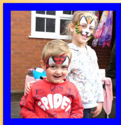
Pictured above: Face painted brother and sister!