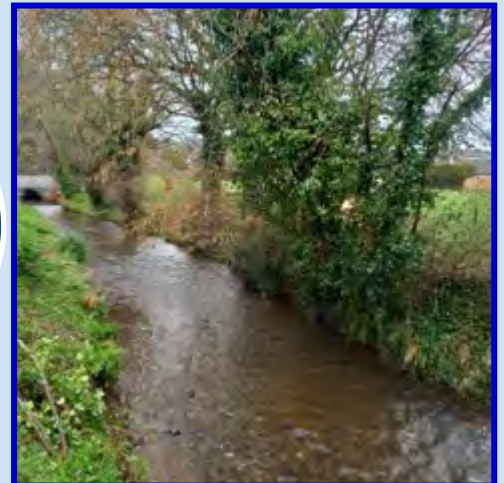
Sandygate stream between the green at Sandygate Mill and Lower Sandygate—(before and after photos)

Thank you to the maintenance team for clearing this area, you've done a great job!