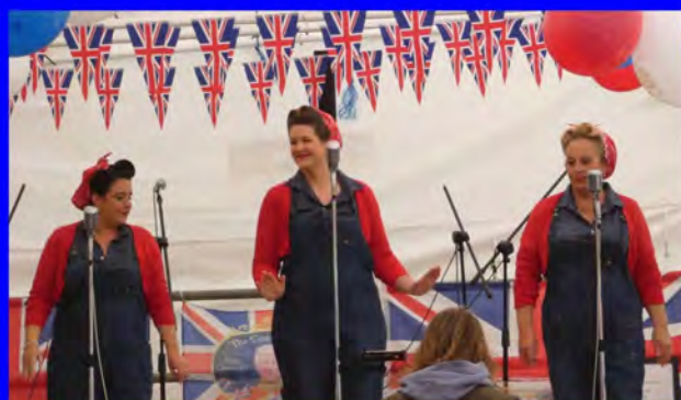
Pictured below —The Liberty Sisters