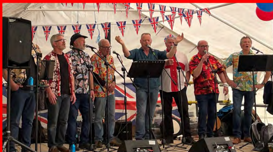
Pictured above—The Back Beach Boyz,