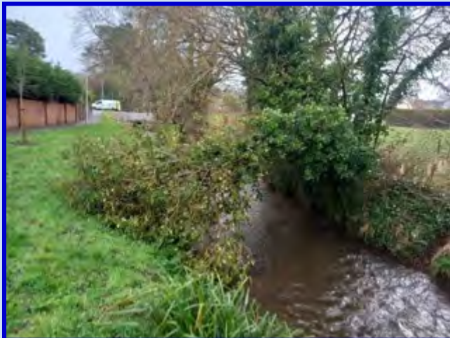
Crossley Moor Road Leat after being cleared

Thank you to the maintenance team for clearing this area, you've done a great job!