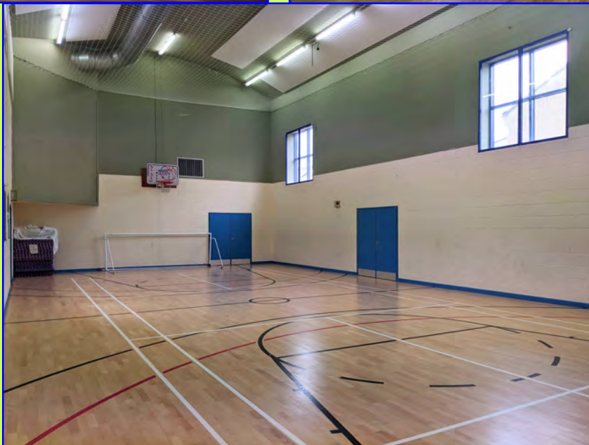
Pictured bottom centre: Small sports hall.