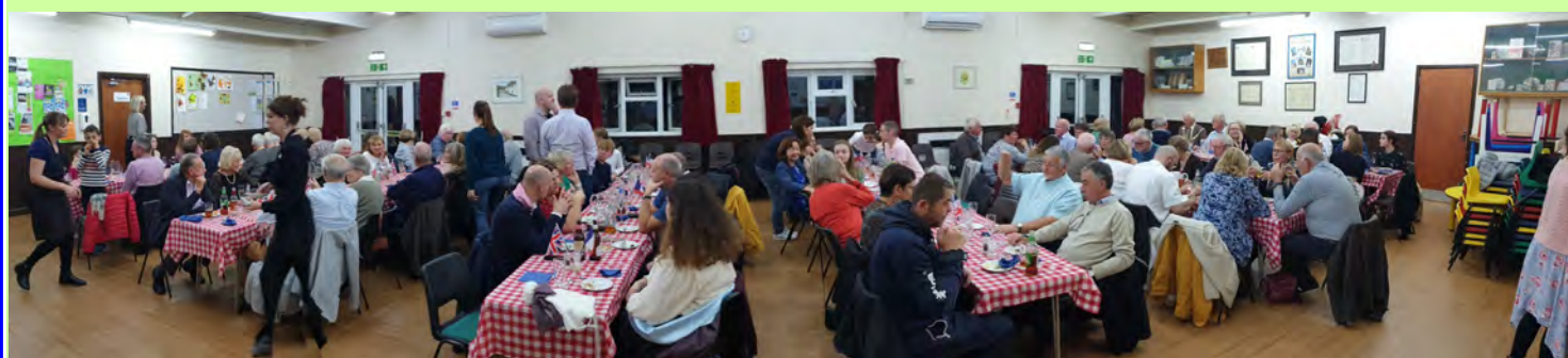
Pictured below: The twinning groups supper at the Kingsteignton Community Hall