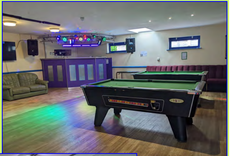
Pictured above right: Disco/games room.