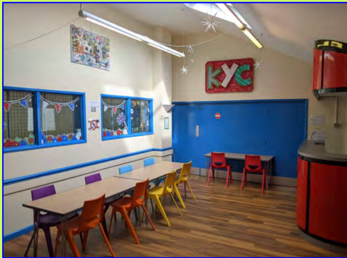
Pictured above left: Kitchen and seating area.

Rooms for hire in KYC Contact KYC Committee Secretary on 07598 752 896 for details