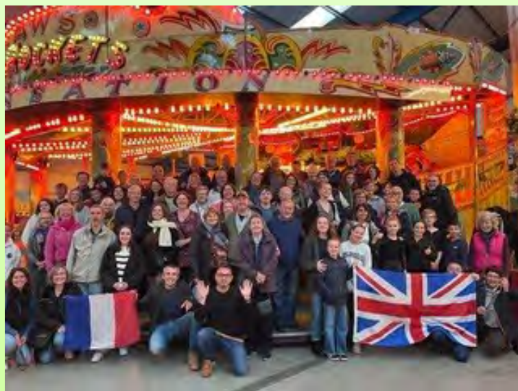
Pictured above: Smiles all round at Dingles Heritage Fairground

To find out more about KOTA, new members are welcome to make contact by Facebook (Search 'KOTA Kingsteignton Twinning')