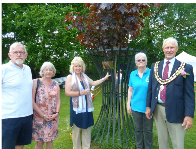
Pictured above, left to right

If you would like to contribute to this worthwhile tree protection scheme, we would welcome you to please contact the Town Council Office.